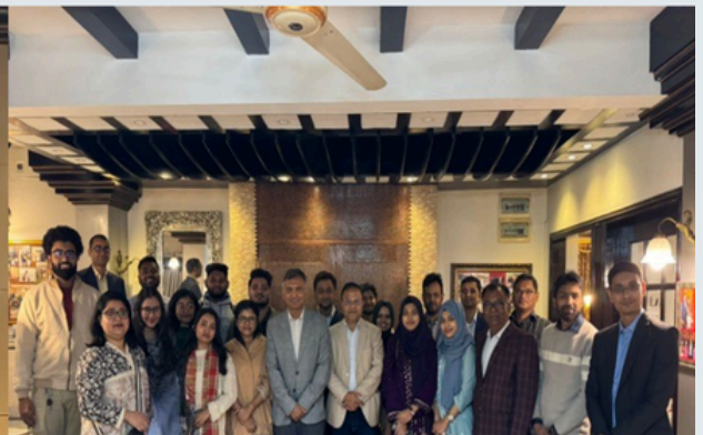
RAPID Annual Dinner 2024