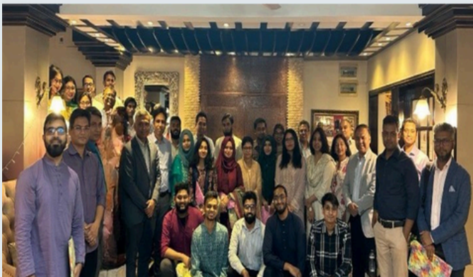
RAPID Iftar 2024

Evenings of Reflection, Connection, and Collaboration