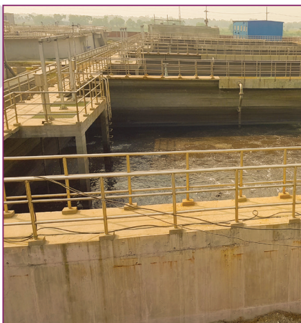
CETP : Central Effluent Treatment Plant

The Leather Working Group (LWG) is made up of member brands, retailers, product manufacturers, leather manufacturers, chemical suppliers and technical experts that have worked together to develop an environmental stewardship protocol specifically for the leather manufacturing industry.