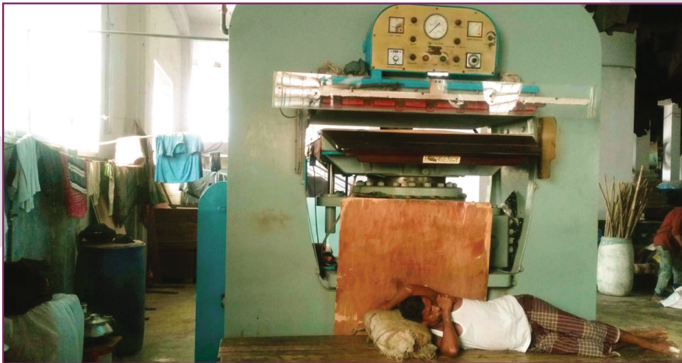
Scenario of working condition inside factory

To ensure a fair wage, the TWU had to negotiate a formal agreement with the tannery owners to pay the temporary workers at least Tk. 8,000 per month whereas the permanent workers currently get about Tk. BDT 11,000 per month. Most of the workers are temporary and do not get any extra benefits and allowances. However, housing, transportation, and food have become way too costly in Savar in comparison with that of in Hazaribagh. Many workers left tannery jobs due to the inability to relocate given the accommodation and transportation problems. Many however still travel to Savar (from Hazaribagh) often by hiring buses for themselves. Although some companies provide for transport facilities for their officials and managers, they have refrained for the workers. Reportedly, a few tanneries arranged transportation for their workers in the first couple of months after the relocation, but it was discontinued later. Most workers find managing accommodation in nearby areas at a reasonable cost is one of the biggest challenges. So far, only one tannery has built a colony nearby, but other tanneries do not have any such plans in the near future. Along with the wage issue, the TWU also supports the workers to ask for their rights to other benefits like housing, transportation, health and so on.