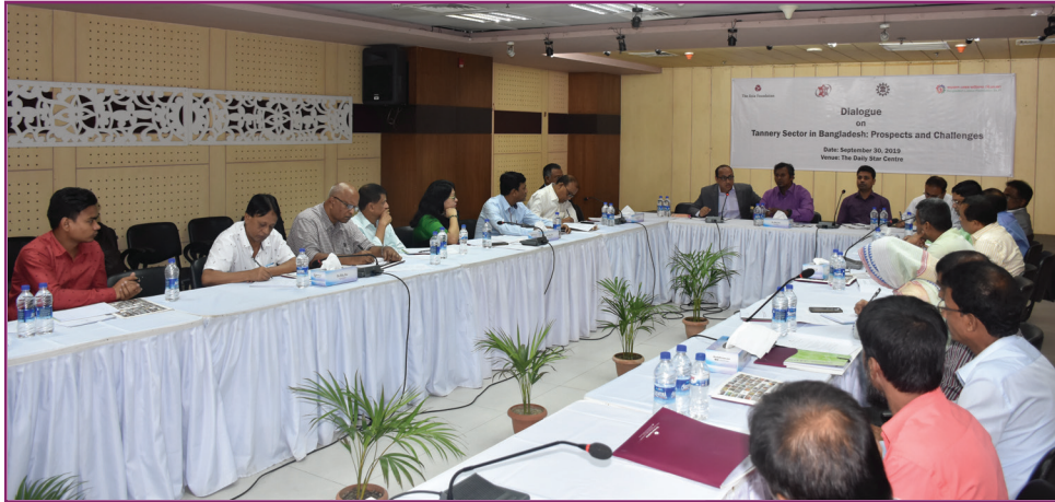
Inclusive dialogue on prospects and challenges of Tannery sector in Bangladesh

➤ Relevant stakeholders including the tannery owners as well as the workers emphasize the need for robust maintenance of the roads and an integrated drainage system throughout the Estate.