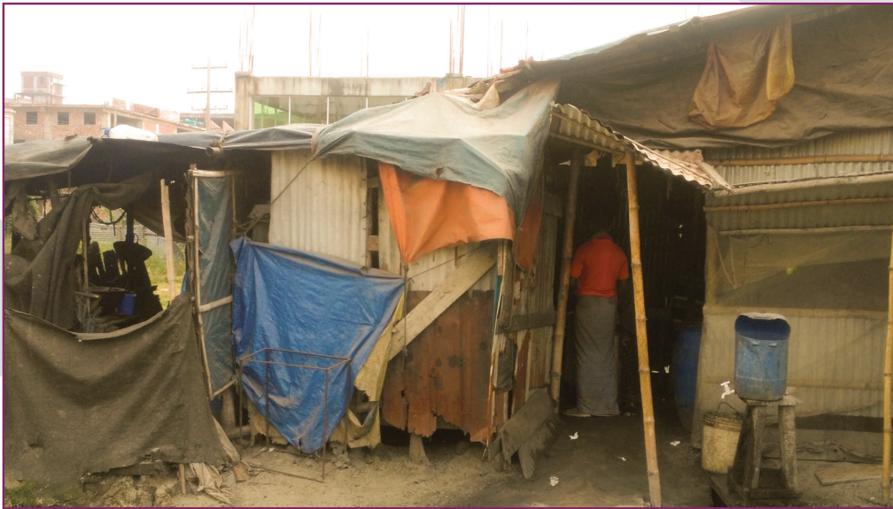
Scenario of food accessibility for tannery workers in TIE

There is no medical facility nearby for the workers. Small medical centres are located in Hemayetpur, about 4 kilometres away from the TIE, while full-fledged medical hospitals are located more than 10 kilometres away (near Savar city). Housing facilities and obtaining low-cost food in nearby areas are bigger challenges. Food and accommodation cost has doubled, as the workers perceive. Commuting to and from the TIE is difficult as the area is far from the nearest urban centres and lack good public transportation system. Furthermore, accordingly to many workers, dust in the air has also become a serious problem, leading to asthma attacks among the workers. Poorly maintained roads, drainage systems, and the footpaths are some of the major reasons behind the massive dust problem. According to the workers, despite all the adversities they facing, they are hardly compensated, while the tannery owners have been compensated by the government.