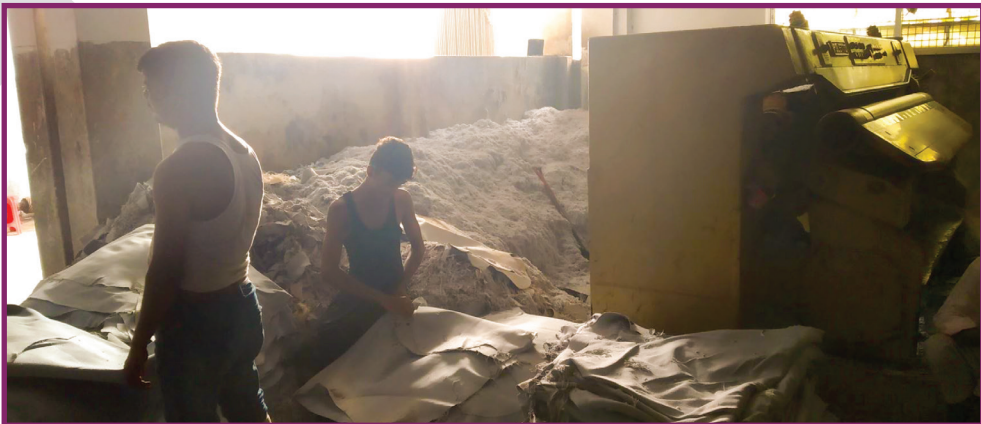
Workers working in the dust area

The workers under the third-party contractors work days and nights relentlessly when there is an assignment to accomplish within a deadline but roam free when there is no assignment and yet they are paid on a monthly basis. About 60 percent of the workers seem to have insufficient knowledge on the minimum wage which has been declared by the government for the tannery workers. Nonetheless, the workers acknowledge the contribution of the TWU in different aspects including recruitment, wages, raising awareness and so on.