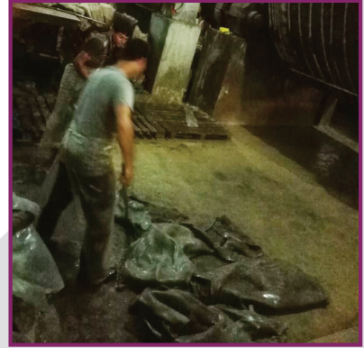
Working condition in drum section

The working conditions after the relocation have barely improved as per the workers. There are about eight thousand workers from 30 tanneries involved in TWU activities. Large and medium tanneries are affiliated with the TWU, while the small ones are often run by third party contractors and are reluctant about their participation. Generally, the standard working hours are maintained in the TIE, but the non-affiliated tanneries barely pay any attention to working hours and other forms of labour rights. The tanneries rented to third-party contractors have no fixed working days and hours and rather have seasonal assignments of completing the job by a deadline.