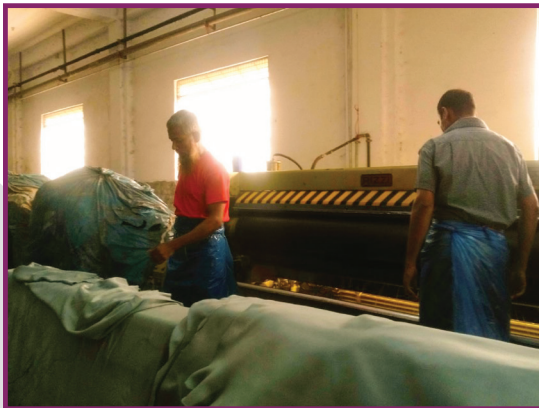
Working condition in tannery

Construction of new factories in the TIE has not brought significant changes in terms of occupational safety of the workers. While the tannery owners have brought new machineries for better processing of leather but are reported to have not brought newer and better safety equipment for the workers. Even where the PPE is available, their number is not enough. The survey data reveal that about 40 percent of the respondents have received gloves and boots from the factories while the remaining 60 percent have received no PPEs. Preparation for fire safety at the factories has been quite weak because of lack of necessary infrastructure and training for workers. About two-thirds of the respondents have seen fire exits and more than half have reported seeing fire extinguishers at their respective tanneries. However, only five percent of the respondents received a firefighting training.