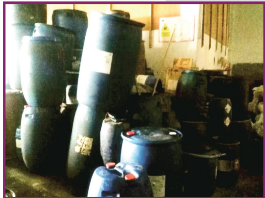
Scenario of chemical storage inside factories