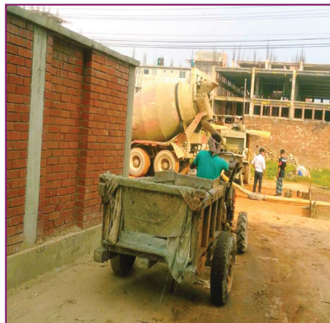
Sludge carrying to dumping yard